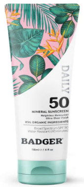
Badger SPF 50 Mineral Sunscreen