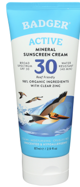
Badger SPF 30 Mineral Sunscreen