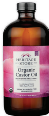
Heritage Store Organic Castor Oil